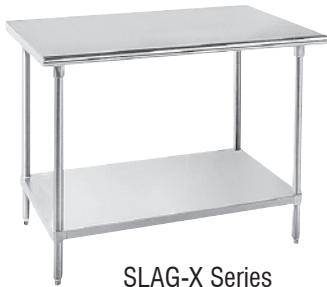
SLAG-X Series Flat Top

LEGS: 1 5/8" diameter tubular stainless steel. Stainless steel gussets. 1" adjustable stainless steel bullet feet.