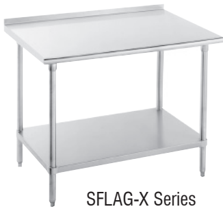
SFLAG-X Series 1 1/2" Backsplash