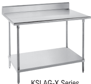
KSLAG-X Series 5" Backsplash